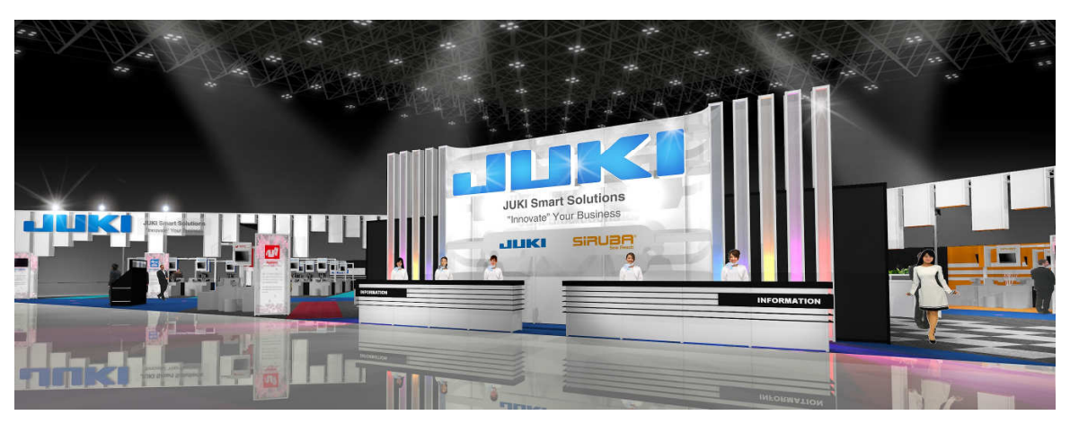
<Conceptual illustration of JUKI booth>

JUKI will be taking part in JIAM 2016 OSAKA Japan International Apparel Machinery & Textile Industry Trade Show, a four-day event to be held from April 6 (Wednesday) to 9 (Saturday) next year in INTEX OSAKA in Osaka, Japan. In the largest area in the exhibition space of JIAM 2016 (175 sections, 1, 575 m²), JUKI, in cooperation with SiRUBA, a Taiwanese industrial sewing machine manufacturer and JUKI's partner in Taiwan, displays sewing machines and related products.