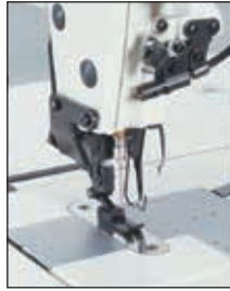
Needle thread clamp mechanism and sliding presser foot