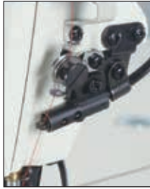
Needle thread draw-out mechanism

The machine comes with a silicon oil lubricating unit, thread spreading mechanism and thread trimming mechanism which trims the thread without fail, thereby consistently ensuring beautifully-finished seams for light- to medium-weight materials. The appearance of the machine is restyled, and it is now colored in a refreshing urban white.