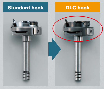
The LU-1500N Series / LU-2800 Series rotary hooks have DLC coating on the inner and outer hooks.

The AMS Series / LK Series shuttle hooks have DLC coating on the shuttle.