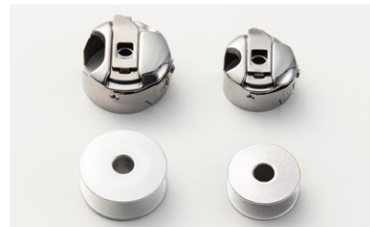
Bobbin for double-capacity hook

The adoption of the horizontal-axis double-capacity hook helps reduce the frequency of bobbin thread replacement, thereby promising sewing work with efficiency. This hook is also helpful not only when sewing with thick thread but also when sewing a long seam length.