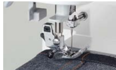
3-12-3 layers of denim.

HZL-G series has powerful feeding thanks to the improved presser foot construction. Heavy material projects, such as hemming denim jeans, can be sewn with ease!