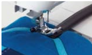
Thick handle can be sewn with ease.