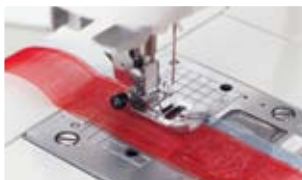
No fabric shrinkage even sewing on extra light weight materials.