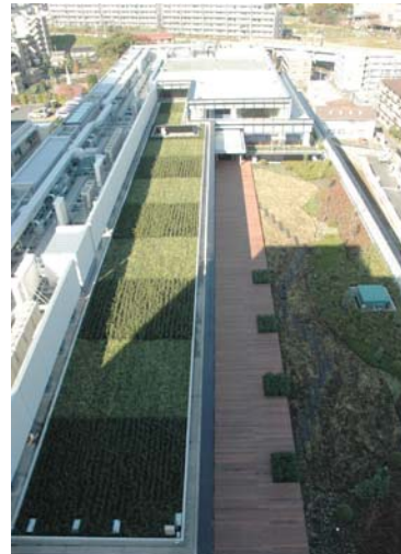
A rooftop garden in west building

The garden with 2.5 times of a standard area in Tokyo, about 1,200m 2 (363.6 tsubo ) was set up in the rooftop of the west building (R&D department). This increased the insulation of the building. As a result, the rise in the room temperature is suppressed in summer and the indoor temperature is not allowed to escape from the room in winter in order to reduce the air-conditioning load. Moreover, it is also useful for improving the amenity in office as employee's eyestrain and spiritual comfort are given.