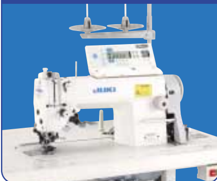
DLM-5400N-7/EC-10B (With a Vertical Edge Trimmer)