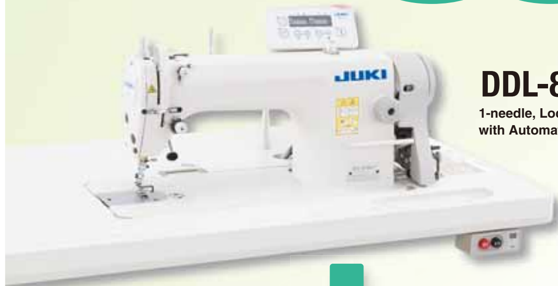
DDL-8700-7 1-needle, Lockstitch Machine with Automatic Thread Trimmer

The DDL-8700-7 is provided with the "new model control box" and the "new model compact servomotor," thereby substantially saving energy.