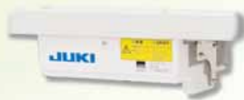
SC-920C The new model control box