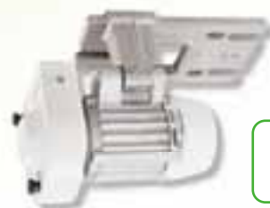
M92 The new model compact-size servomotor